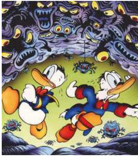
Fig. 1: Ducks experiencing goose bumps