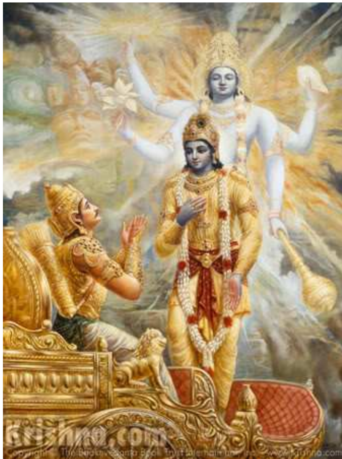
Figure 3: Arjuna’s hair stand on end as he beholds god Krishna.

truths – like Arjuna, the hero of the Bhagavad Gita, whose hair stands on end when he recognizes the universal nature of his charioteer, god Krishna (11,14). And the Bhagavata Purana, focused on devotional love for the incarnations of Vishnu, particularly Krishna, clearly states: “How can without bhakti one’s hair stand on end, without loving service the heart melt, without devotion the tears flow, the bliss be and one’s consciousness be purified?” (Canto 11,14,23).