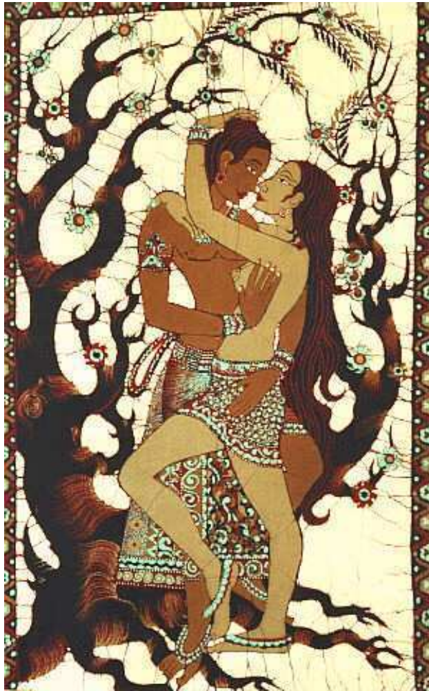
Fig. 2: Prickling touch after the Kamasutra.

Now we understand the deeper meaning the prickle has for many masters who transformed carnal love into spiritual love: love is not directed to a person, but to God; the sexual orgasm is replaced by the whole body orgasm of an overwhelming and ecstatic prickle. The Indian Yoga textbook Gherandasamhita , for example, classifies the prickle feeling as a phenomenon of bhakti , devotional love (7,14-15). And in the Hindu epics and legends, the hair of the bodies of heroes, yogis and gods raise when they behold divine beings or hear timeless